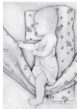
Figure 2 – Support of scapular area