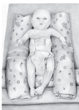
Figure 1 - Maximum flexion