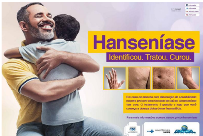
Poster Translation: Leprosy Identify. Treat. Cure In the case of spotting with reduced sensitivity on the skin, visit a Health Unit. Leprosy has a cure. The treatment is free and as soon as you begin treatment in stops being transmitted. For more information access: UHS / Ministry of health Figure 4 – Campaign from 2018 to 2020