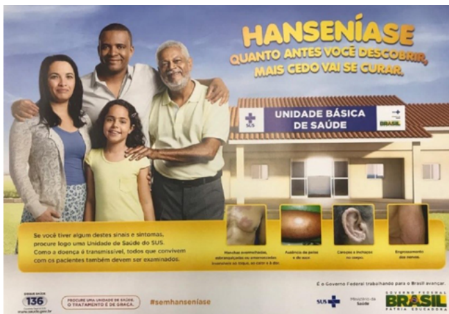
Poster Translation: Leprosy. The early you discover it the early you will be cured BASIC HEALTH UNIT If you have any of these signs go to a UHS Health Unit immediately Since the disease is communicable, all those who live with you should get tested Red, white or brown spotting, sensitive to touch, heat or pain Absence of hair and sweat? Lumps and swelling on the body Nerve thickening Figure 3 – Campaign 2016