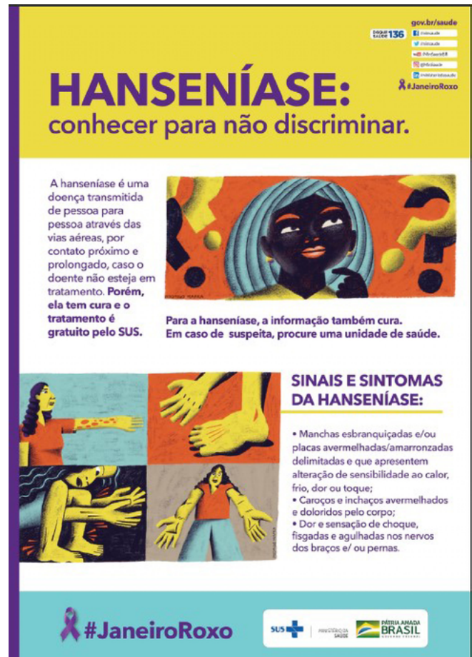
Poster Translation: #PurpleJanuary Leprosy: Know more to not discriminate Leprosy is a disease transmitted from person to person through airways, prolonged and close contact, if the afflicted is not undergoing treatment. However, there is a cure, and free treatment through the UHS. With Leprosy, information also cures If you suspect you have it, visit a health clinic Signs and symptoms of Leprosy -White and/or brownish/reddish spotting, delimited and that present alteration in the sensitivity to heat, cold, pain or touch; -Lumps and reddish and painful swelling on the body; -Pain and shock, pinching, needle sensation in the nerves in the arms and/or legs. #PurpleJanuary UHS / Ministry of health Figure 5 – Campaign 2021

Note that people affected by leprosy are represented in posters 1C, 3 and 4 by people of different ages, color/race, sex and social segments, who have faces, voices and gestures (smiles, attentive gaze), indicating that leprosy can affect anyone. In the images, the characters are represented in an affectionate relationship, touching each other's bodies bi-directionally, with happy faces, sharing glances, kisses, and hugs, and with no allusion to the possible marks of leprosy. To convince us, the readers, of this representation, we used the naturalistic mode and the framing of the images in medium shot format, which aims to convey a close relationship between the viewer and the participant, enabling the complicity of emotions and feelings. On the other hand, in these same posters, there are, in lesser prominence, images of human body parts with visible signs of leprosy.