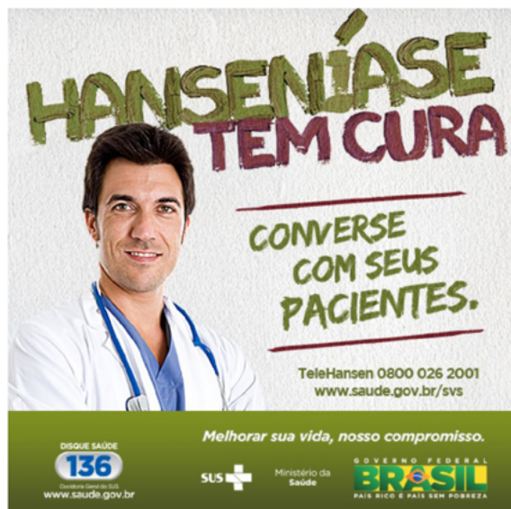
Figure 1A – Campaign 2014

Poster Translation: There is a cure for leprosy TALK TO YOUR PATIENTS CALL HEALTH Improving your life, is our commitment Ministry of Health