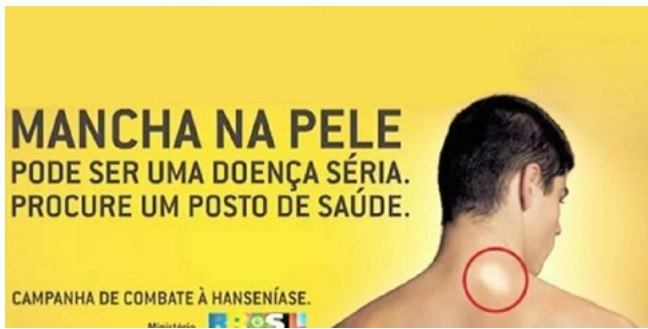
Poster Translation: SKIN SPOTTING Could be a serious disease Visit a health unit Campaign for fighting Leprosy / Ministry of health Figure 2B – Campaign 2015