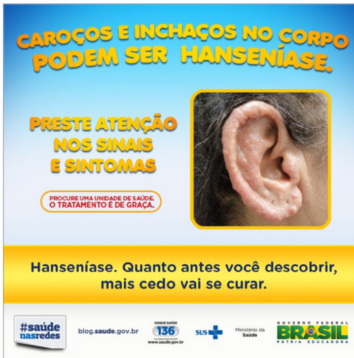
Figure 1C – Campaign 2014

Poster Translation: Lumps and swelling in your body could be Leprosy Pay attention to the signs and symptoms Visit a health unit The treatment is free Leprosy. The early you discover it the early you will be cured #healthontheinternet CALL HEALTH Ministry of Health