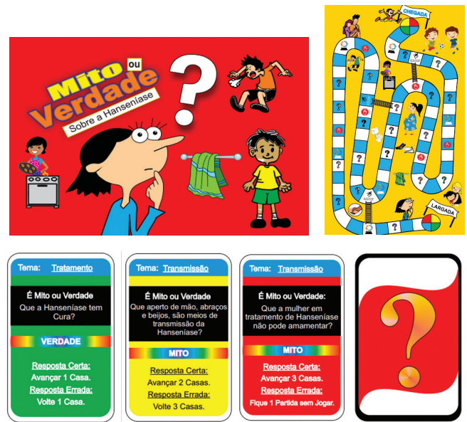
Figure 2 - Final version of the game “Myth or Truth” on leprosy, Brazil, 2015.

The technology can be used by at least two and a maximum of four adolescents and addresses: the concept of leprosy, the form of transmission, symptoms, diagnosis, treatment, and prejudice. The game consists of a board, four pins of different colors (blue, yellow, red and green), one die and 31 question and answer cards, called “card questions”. Eleven illustrations arranged on the board and in the box containing it are also part of the game and were specially developed for technology, related to the theme and raising doubts and discussions about the disease. Approximately, the technology costs 15 US dollars (Figure 2) and could be less expensive if the board and pins were made of paper or recycled materials. The board and cards are available for download free of charge as an appendix of this article.