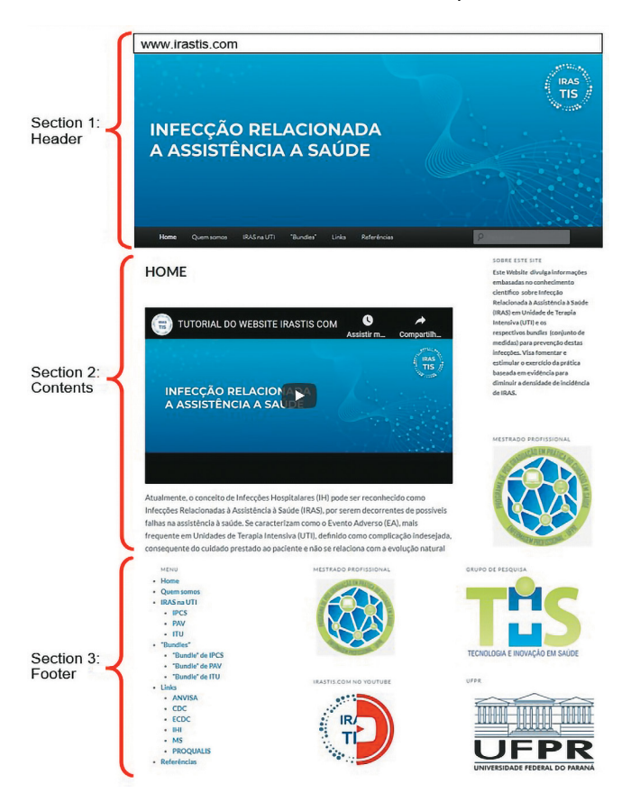
Figure 2 - Main page of the developed website

Below the main menu, in Section 2, left column (in HOME), there is a tutorial video that guides users on how to browse the website. This column changes according to the clicked navigation tab. On the right column, in all accessed pages, there are: the text "On this website", which contains a brief summary of the website content; several links that direct users to websites of public institutions that address the HAIs subject; another search box, whose function is the same of that present on the main page (Section 1) and that allows to search contents published on the website; the number of visitors; and a "Comments" area, in which users can write comments and ask questions.