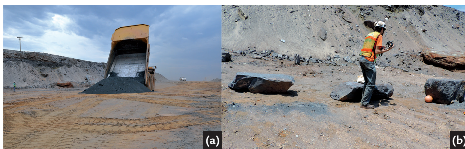
Figure 1 ROM being dumped (a) and larger blocks (BM1) being photographed (b).

The remaining pile separated from the larger blocks was denominated "original pile". This original pile was flattened and demarcated to be divided into "four pieces" (Figure 2 (a)).