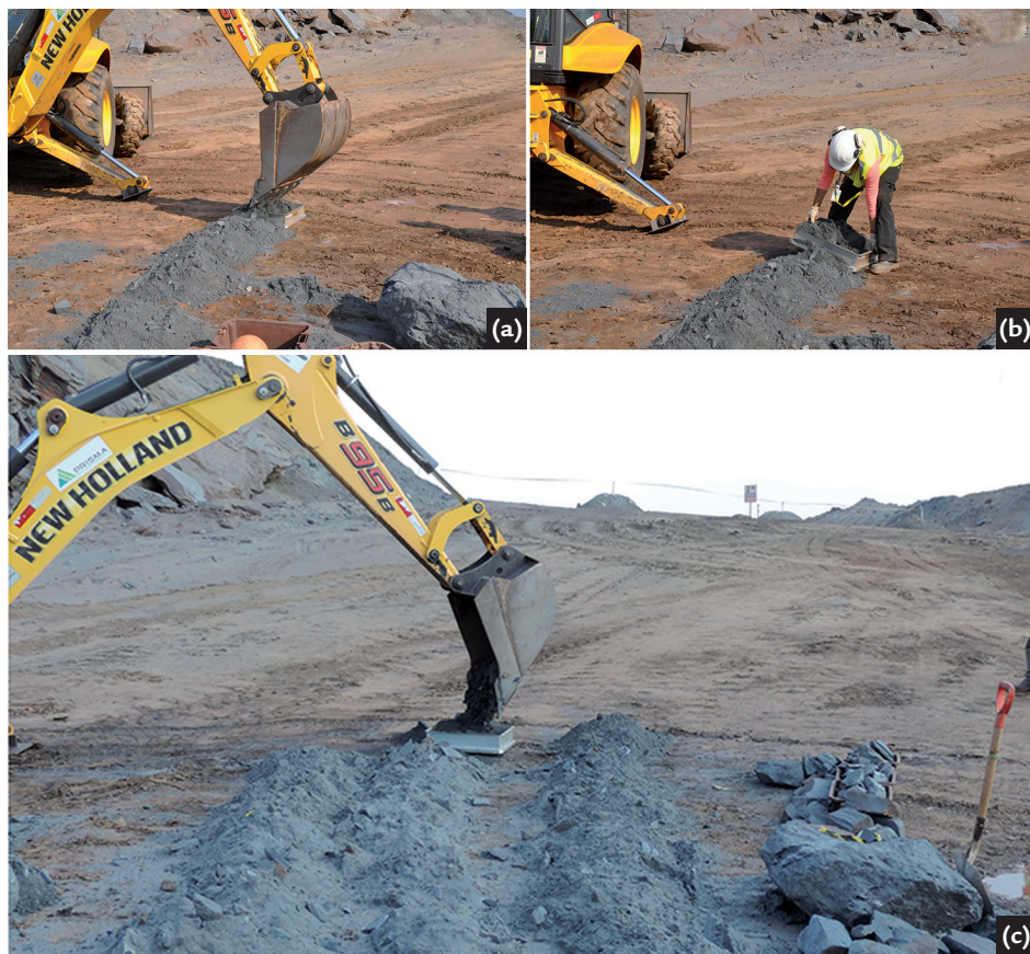
Figure 4 Classification and formation process of the rows.

Figure 4 (a,b) illustrates the formation process of the rows containing ore fragments smaller than 25 mm while the larger fragments retained on the screen were manually picked up or pushed by the backhoe loader to a near site. Figure 4 (c) shows the final disposal of the three rows containing 10 mm passing material and a fourth with the larger fragments (BM2).