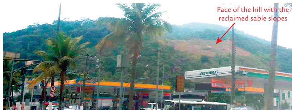
Figure 3 Reclaimed face of the hill in 2014.

licensing process. Therefore, the activity is important not only from the point of view of geotechnical stability, but also from an aesthetic one, and the work was performed accordingly, as shown in photos from years 2004, 2007 and 2014 (Figures 1a, 2b and 3).