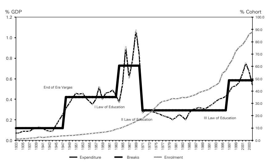
Graph 2: Structural Breaks: Secondary Education