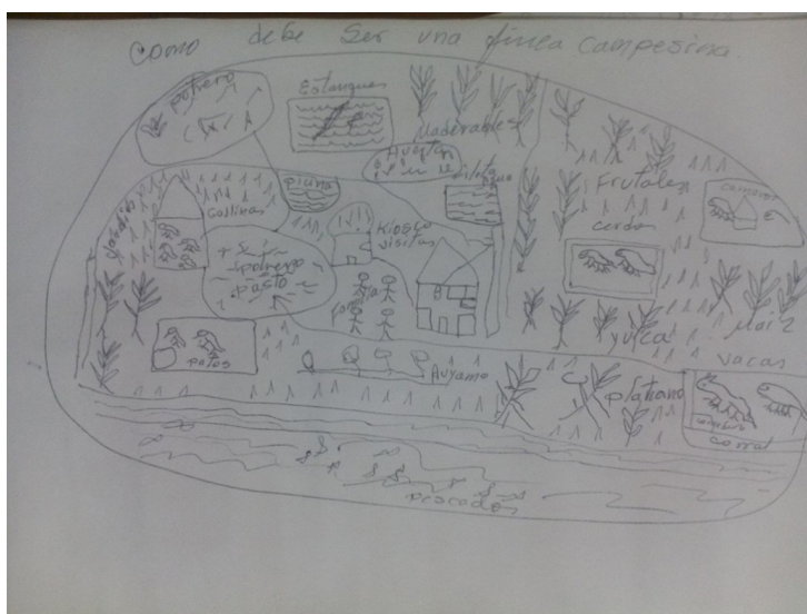
Figure 3. Scheme of the peasant farm San Pablo (Asomercam peasant community)

The sixth model is that of Finca de Los Santos, a model that stands out for its condition as a smallholding, the traditional cultivation of goats and sheep, as well as at the vegetable level, nopal, chaya, agave, sweet potato, among others. In the external elements, the harvest and water reservoirs are relevant. Finally, the model of the peasant farm of San Vicente de Chucurí, in which subsistence crops (called sancocho farm), the conservation of forest and water, minor species stand out. This model highlights the family and community that give life to the farm. In the external aspects, road accesses, praying centers, an animal benefit center and a transformation plant stand out. By way of example, two peasant farm models are presented in two diverse geographical environments (Figures 3 and 4), San Pablo on the banks of the Magdalena River and San Vicente de Chucurí in the vicinity of the Serranía Yariguíes, which allows us to identify the differentiated interaction that the peasant community builds with the biodiversity of its environment.