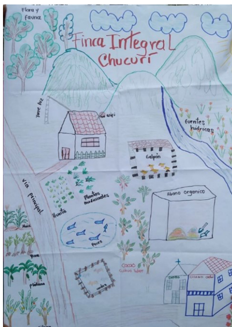
Figure 4. Scheme of the peasant farm San Vicente (Corchucurí peasant community)

After characterizing the peasant organizations, three relevant topics to be discussed are presented hereunder: tension among inclusion, adaptation, and identity; tension of agribusiness and sustainability and the tension between agroecology and modernity.