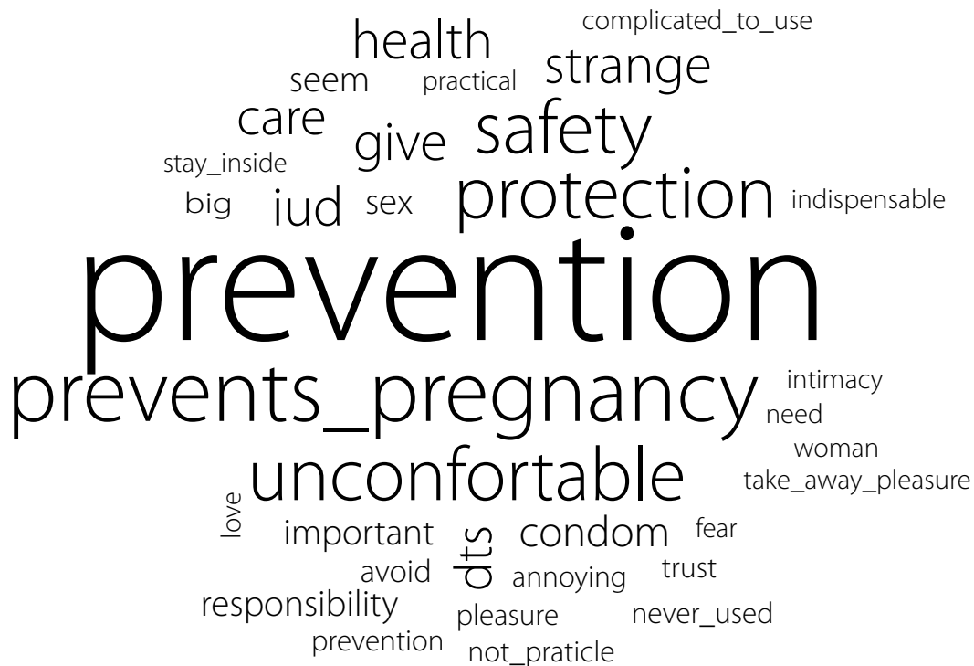
Image 2- Word-cloud resulting from the inductive term “female condom”, replaced. Senhor do Bonfim-Bahia-Brasil, 2018.

Data from the FWAT that were processed by the IRA-MUTEQ software are shown in image 2.