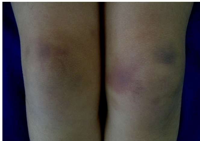
Figure 2. Presence of petechiae and hematomas around the knees due to minor wounds

During anamnesis it was verified a history of viral infection before the development of IPT symptoms. In the physical exam, petechiae and hematomas were noticed around the knees (Figure 2) and on the forearm. According to the mother, these purple spots developed spontaneously and/or after minor wounds.