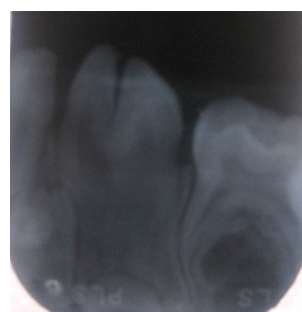
Figure 3. Periapical radiograph showing the fusion of elements 72 and 73

Intra-buccal exam revealed no buccal alterations as the result of IPT. Buccal hygiene of the patient was satisfactory and no dental caries and gingival inflammation were observed. An anterior open bite due to pacifier sucking habit, removed 3 months before the first visit, was found. After the clinical and radiographic exam, it was verified the presence of the fusion of elements 72 and 73 (Figure 3).