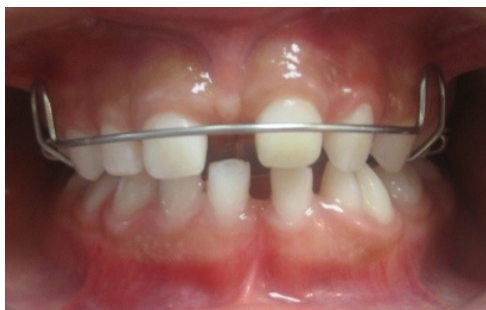
Figure 6. Follow up after 30 days. Usage control of the apparatus is fundamental to avoid possible traumas of the buccal mucosa that might occur with the occlusal changes.