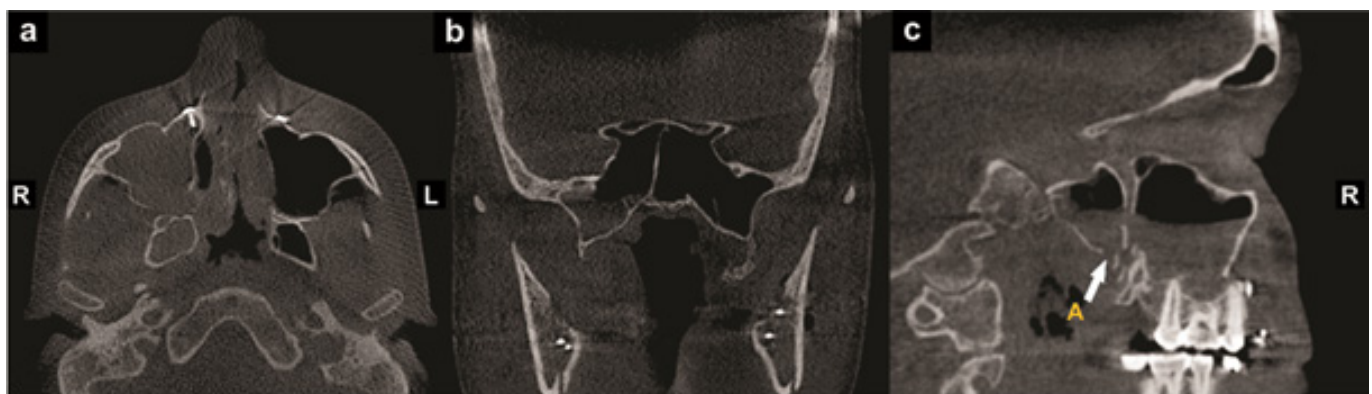
Figure 2. Postoperative CBCT exam for orthognathic surgery, showing the SS'opacification on the right side in multiplanar (a) axial, (b) coronal and (c) sagittal reconstructions. The fracture in the floor of the SS is observed in sagittal reconstruction (c-A).

In the immediate postoperative CBCT image (figures 2a-c), it was found a hyperdense image of the SS only on the right side with compromise of the floor, due to the factors related to the transoperative period. Among these, can be the greater force applied in the right side associated with greater resistance at the moment of pterygomaxillary disjunction, because individuals with CLP have scarring fibrosis areas and bone more sclerotic. In addition, the fixing and immobilizing the plates (forcing the right side more) or the chisel positioning at different heights can also justify this harm. The hyperdense image of the SS is horizontally level and suggests an extravasation liquid content inside (figure 2c-A). On the left side, the procedure was performed with no sphenoid sinus walls involved.