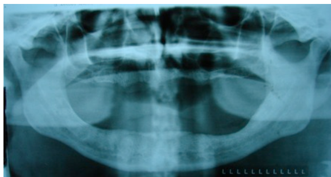
Figure 2. Preoperative panoramic radiograph suggesting pneumatization of the maxillary sinus and severe bilateral bone resorption in the posterior region of the mandible.