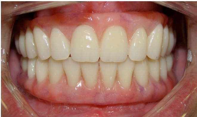
Figure 6. Complete dentures fixed on angulated implants, restoring aesthetics and masticatory function.

The patient was thoroughly followed-up for 24 months after denture placement. The assessments were made at 90-day intervals, considering the following aspects: symptom recurrence assessed by the visual analog scale 9 ; occlusal stability assessed by occlusal mapping, making sure the bilateral balanced occlusion type was maintained; loosening of the retention screws assessed with a digital screwdriver; and masticatory efficiency assessment based on the patient's report. None of the considered factors recurred after this period.