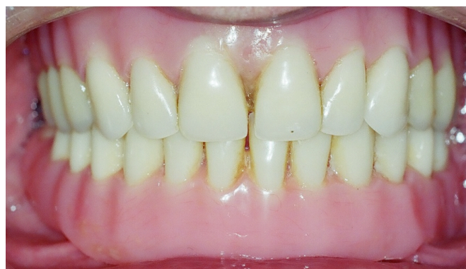
Figure 1. Removable complete dentures with inadequate aesthetics.

A 57-year-old male patient visited the clinic of the Implantology Specialization Program of the Cearense School of Dentistry - ECO/SLM in Fortaleza (CE), wearing removable upper and lower complete dentures. He complained of difficulty chewing because of denture instability, bad aesthetics, and bilateral fatigue and pain in the temporomandibular joint (TMJ) and the masseter and temporal muscle regions during mastication. He reported having used the dentures for 10 years (Figure 1) and expressed the desire to replace them with fixed dentures. The patient did not report systemic diseases or surgeries that could compromise endosseous implants.