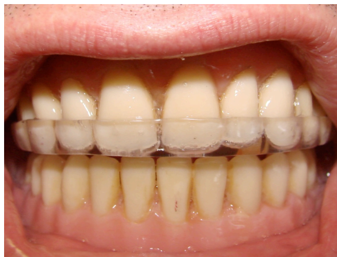
Figure 3. Flat occlusal plane splint positioned on the upper complete denture, producing simultaneous bilateral contacts with maximum intercuspation and during excursive mandibular movements.

Ltda., Pirassununga, Brazil), respecting its flat and smooth anteroposterior and laterolateral configuration. Once finished and polished, the splint was adjusted to the upper complete denture to produce simultaneous bilateral contacts with maximum intercuspation and during excursive mandibular movements (Figure 3).