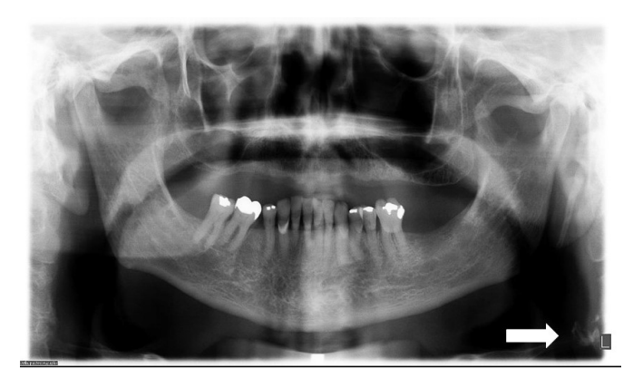
Figure 1. Well delimited radiopaque image on the left side close to the intervertebral space C3 and C4 (arrow).

For differential diagnosis between atheromas and other types of calcifications with some radiographic similarity, the option was taken to perform the Manzi Projection, an anterior-posterior projection performed in the cephalometric unit with the Kodak Ceph 9000 3D apparatus (Carestream Health, Inc.), in which the patient is positioned with the Frankfurt plane slightly inclined (between 15-30°) towards the vertical position. On performing the exam, the presence of a radiopaque mass was verified on the left side, site of the carotid trajectory, compatible with calcified atheroma in the carotid artery (Figure 2).