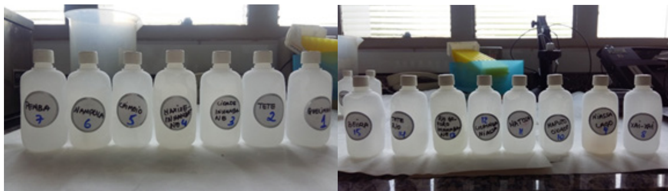
Figure 2. Samples were packaged in a polyethylene bottle.

The collections were carried out in duplicates directly from the taps in the residents’ homes. The fluoride concentration of the water samples was determined in duplicate. For water analysis was used an ion-specific electrode as an effective method for monitoring fluoride levels in drinking-water which is generally accepted as the accepted gold standard method, the ion-sensitive electrode (Orion 9609), coupled to a potentiometer (Procyon, model 720).