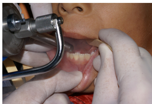
Figure 3. Direct spray application of liquid nitrogen during the treatment.