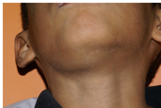
Figure 1. Extraoral view of plunging ranula of a 8 year, 6-month-old male patient. The mucus collection is in the infra mylohyoid compartment of the neck.

After signed informed consent from the parents, the treatment was performed. Considering his age and fearful behavior, the option of treatment was direct spray application of liquid nitrogen without local anesthesia (Figure 3). A cryoprobe was attached to the liquid nitrogen spray equipment. The lesion was exposed directly to 4 consecutive freeze-thaw cycles. Each cycle of 5 to 10 sec, beginning at the center of the lesion, then all the borders until the lesion appeared white and frozen (ice-ball). The Figure 4 shows the clinical appearance 12 days after the procedure. The lesion had not disappeared completely and a secondary application was performed, using the same method. At the 1year follow-up visit, the lesion had disappeared completely (Figures 5 and 6).