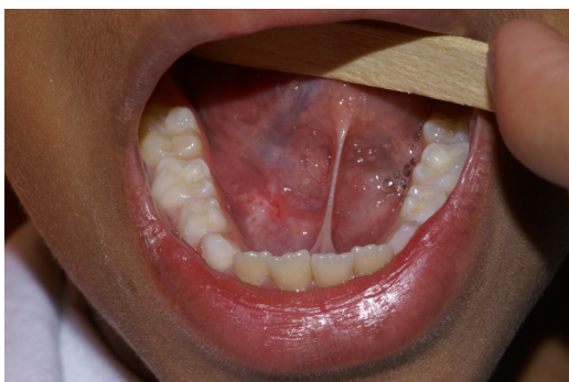
Figure 5. Clinical aspect after 1 year. Complete disappearance of the lesion without scar formation.