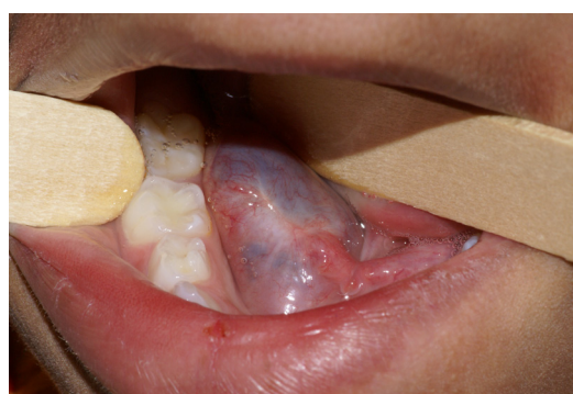
Figure 2. Intraoral view of plunging ranula.