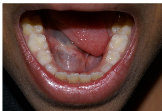
Figure 4. Appearance of lesion 12 days after treatment. The lesion had not disappeared completely and it was treated a second time with cryosurgery.