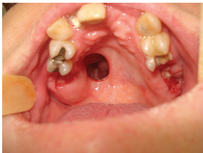
Figure 3 . Patient intraoral aspect at the dental treatment beginning.