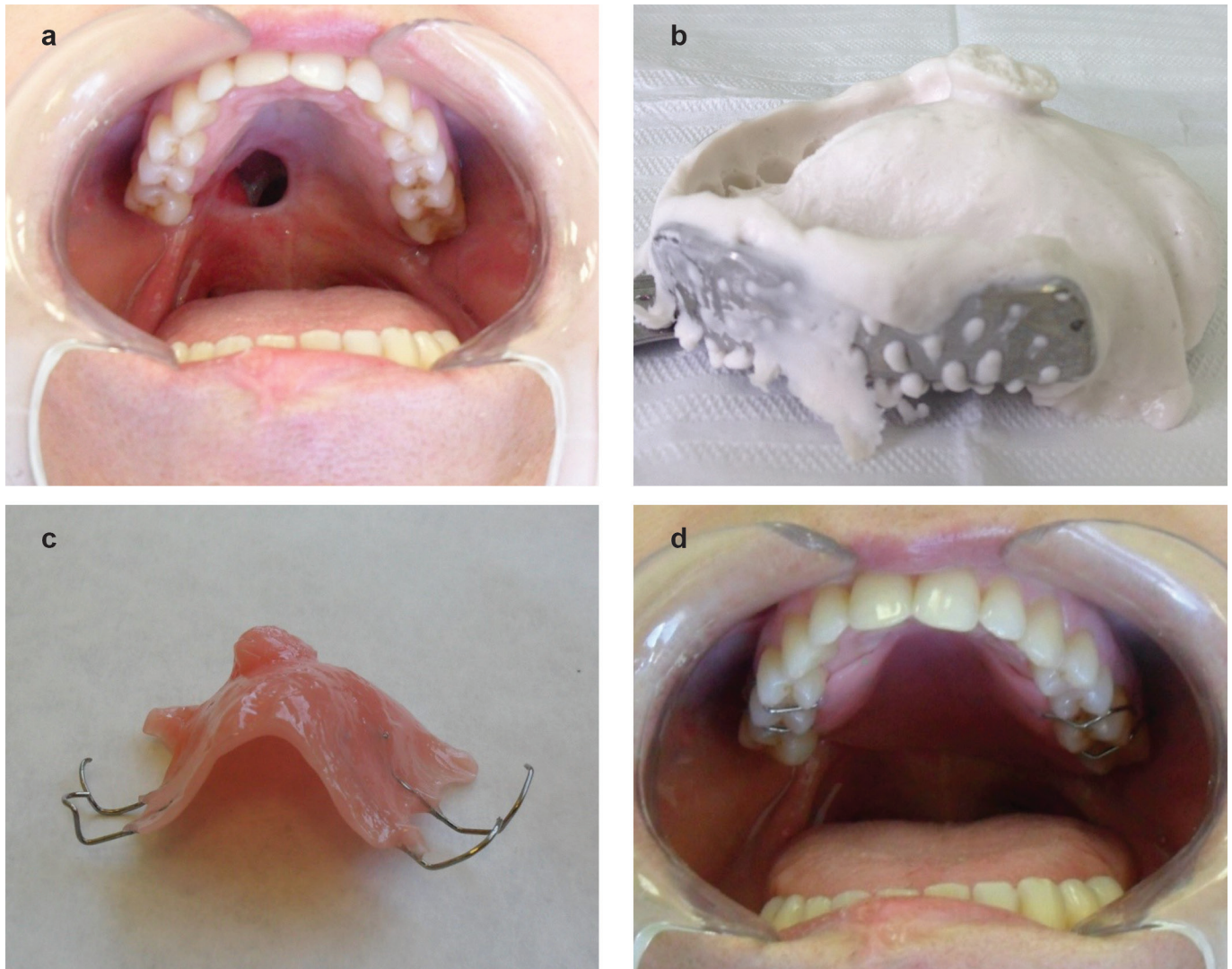
Figure 5 . A) Current aspect of the patient palate.B) Molding with alginate.C) Provisional obturator prosthesis.D) Provisional obturator prosthesis installed.