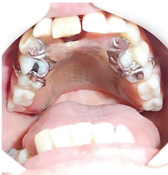
Figure 4 . Patient final aspect with the definitive obturator prosthesis in use for 3.5 years.