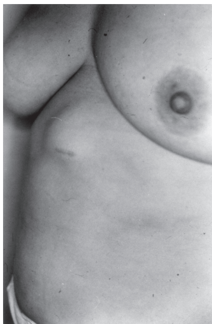
Figure 1 - Reducible painless bulging in the epigastric scar after laparoscopy.

Another related factor was reported by Azurin et al. , who showed that 90% of their patients with hernias in the umbilical wound after laparoscopy had an incidental finding of a pre-existing umbilical hernia 3 . It is important to consider evaluating the need for use