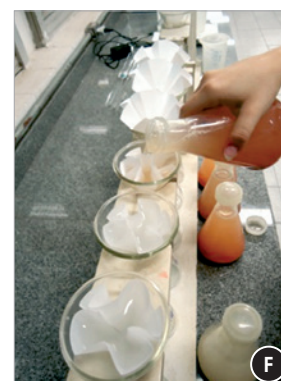
Filtering the set of tests