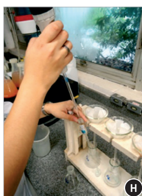
Pipetting a volume set to titration