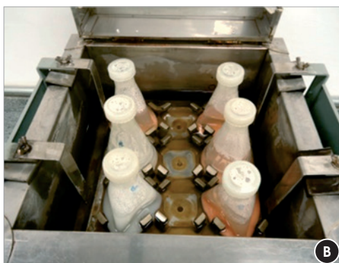
Detail of Dubnoff shaking water bath