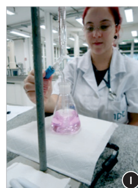
Titration of a sample

pozzolanic materials analyzed in the IPT's Laboratory in the last three years, tests being carried out with one gram and two grams of calcium oxide, respectively.