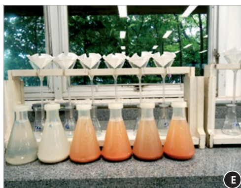
Decantation before filtration