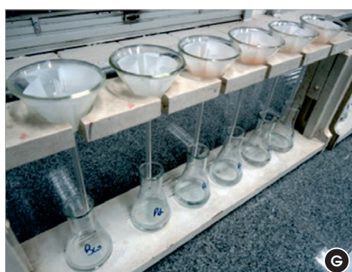
Samples at the end of filtration