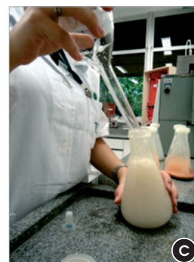
Addition of a sucrose solution