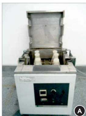
Dubnoff shaking water bath