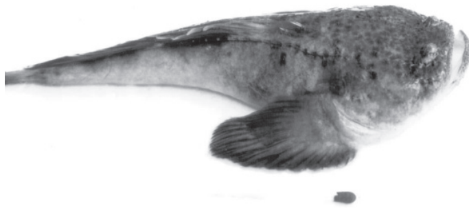
Fig. 1 - Thalassophryne nattereri , the niquim or Brazilian toadfish. Note the venomous spines on the dorsal fin and gills cover.

The authors observed 26 patients injured by niquims ( Thalassophryne