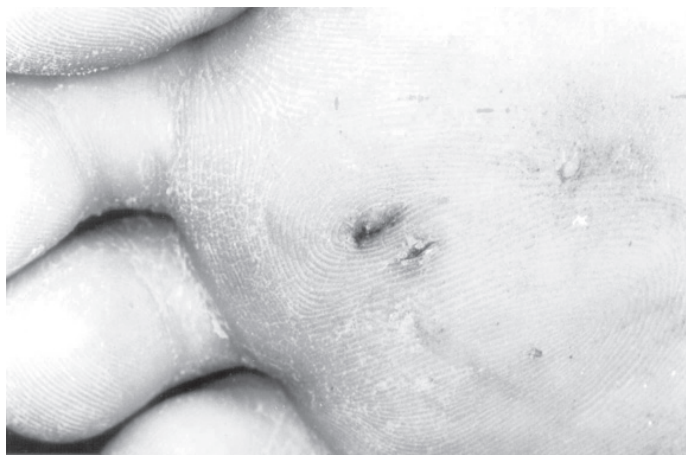
Fig. 3 - Recent injury in a fisherman. The punctures reproduced the anatomy of the dorsal fin spines. There were erythema, edema and intense pain (6 hours).

All the patients were male fishermen, aging from 7-64 years old. About 80% of the fishermen were injured stepping on the fish in shallow waters and 20% while removing the fishes from the fish-nets. The main manifestations were intense local pain, erythema and edema (100% of the victims – Fig. 3). Follow-up by one week was possible in 28 patients (65%). Four of these patients (14%) developed local blisters, nine (30%) presented local skin necrosis (Fig. 4) and 10 (36%) presented local bacterial infection that was treated with cefalexin 2 gr/day for 10 days. Skin necrosis and clinic bacterial infection in the same patient were noted in three fishermen, but the importance of venom, infection or both in the necrosis is not clear for us.