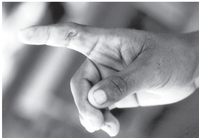
Fig. 4 - Cutaneous necrosis caused by Thalassophryne nattereri envenoming (4 days). Necrosis was observed in about 10% of the injured fishermen.

Injuries provoked by toadfishes of the specie T. nattereri were reported in Brazil seventy years ago 2,3,4 . These fishes present the most advanced venomous apparatus of all the venomous fishes of the world,