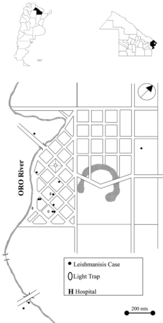
Fig. 1 - General Vedia locality showing case and light trap localization. Upper left corner: Argentina, Province of Chaco in black. Upper right corner: Province of Chaco, Department of Bermejo in black.

The collected insects corresponded in all cases to the species Lutzomyia intermedia s. l.; 12 specimens were collected at the Oro river shore and 8 in the General Vedia Hospital, with a prevalence of females of 87.5%. This species had already been the only one collected on the port of Las Palmas and in the Oro river before 1960 4 .