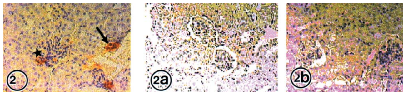
Fig. 2 - Desmin in control mice peritubular (arrow) and glomerular capillaries (stars) were positive. X 20. 2a - Desmin localization disappears 24 hours after inoculation with crude venom. X 20. 2b - Desmin localization disappears 24 hours after inoculation with Uracoína-1. X 20.