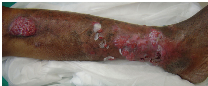
Fig 1 - Extensive tumoral lesions.