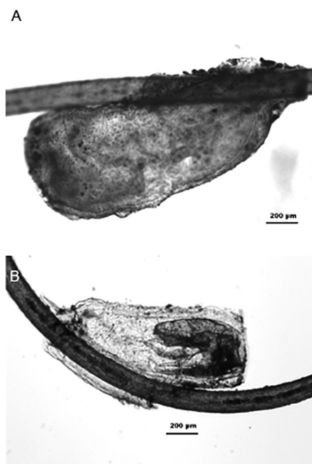
Fig. 1 - Eggs/nits under bright field microscopy. After the rehydration process, it is possible to visualize the embryonic stage inside the eggshell. 50 nits were measured: the size ranged between 1,126.92 µm (length) and 469.38 µm (width). Scale bar = 200 µm.

The morphological characteristics of the nits as well as adults, and the maximum width (average: 469.38 ± 100 µm) and length (average: 1,126.92 ± 221 µm) of the nit size showed no differences when compared with modern nits. The good state of preservation of nits/adults allowed a morphologically detailed description by light and scanning electron microscopy, helping to confirm its morphological characteristics and to compare with other descriptions in the literature (Fig. 1 and 2). Nymphs inside the eggs could be identified after the eggshell was removed with adhesive tape (Fig. 2B-2D).