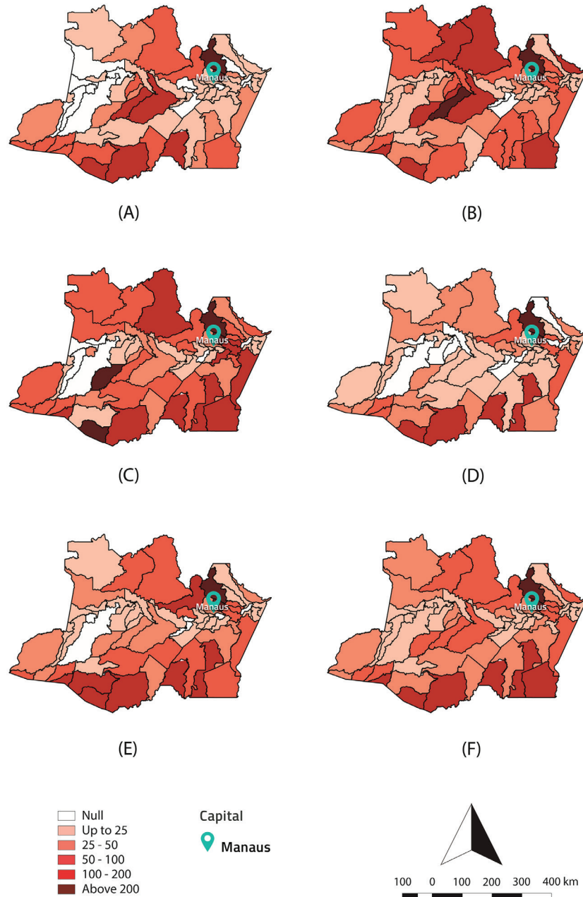
Figure 2 - Spatial distribution of incidence rate per 100,000 inhabitants of American Tegumentary Leishmaniasis, Amazonas, 2010 to 2014. A) 2010; B) 2011; C) 2012; D) 2013; E) 2014; F) 2010 to 2014.

Another aspect responsible for neglected ATL, especially among affected people, is that when an individual has an open wound on the skin, he/she may believe that it will heal by itself in time, and usually skin problems are not a priority and are perceived as aesthetic concerns only 20 . This may be an explanation for the persistence of the endemic disease, since the individual may remain infected for a long time without any treatment.