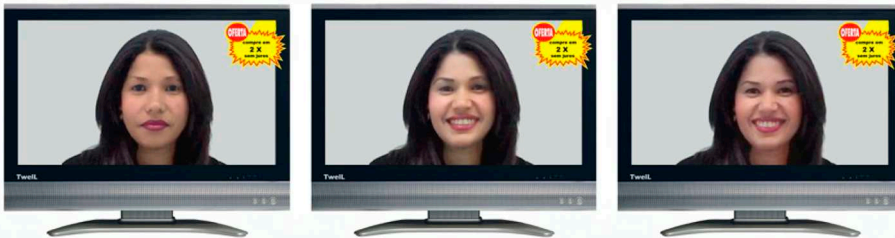
Figure 2. Neutral, false and genuine facial expressions, respectively

We created static ads for a fictitious TV brand featuring a conventionally attractive model displaying three different types of facial expressions. To achieve a genuinely happy facial expression, we recorded the model talking about pleasant circumstances. To achieve a false smile, we asked her to comment about a negative situation and then smile for the camera. In this way, we ensured that the smile was false and that she was not transmitting a positive emotion. To accomplish a neutral face, we asked her to talk about her routine. With the frames from the videos, we created the final photos and using Photoshop to ensure that the model's neck and hair were identical in each (Figure 2). We developed a television press advertising changing only the facial expressions. Throughout a 10-min recording the model shared happy situations that had happened in her life. We then asked her to tell us about her job. We selected pictures to build the genuine smiling face and the fake smile from this recording. Using Photoshop, we controlled the images to maintain the model's neck and hair the same in all the print ads. In this way, we were able to guarantee that only the facial expression was different.