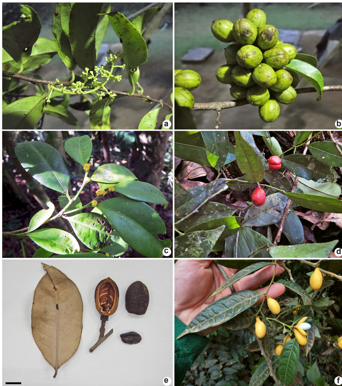
Figure 2 – a-b. Celastrus liebmannii – a. inflorescence; b. immature fruits. c-d. Monteverdia brasiliensis – c. flowers; d. fruits. e. M. fugax – leaf and fruit. f. M. longifolia – fruits. (a-b. Lombardi et al. 10673; c. Marcusso et al. 951; d. Marcusso et al. 1585; e. Rossini et al. 466; f. Marcusso et al. 1845). Scale: e = 1 cm.

green to green whitish; sepals 1 \times 0.8 mm, ovate, margin erose to sparsely ciliate; petals 1.35\text{--}1.75 \times 1.65\text{--}1.80 mm, large-obovate, margin entire to erose; disc 1.2–1.3 mm in diam., rounded, margin entire, light green in vivo . Fruits 9\text{--}19 \times 6\text{--}10