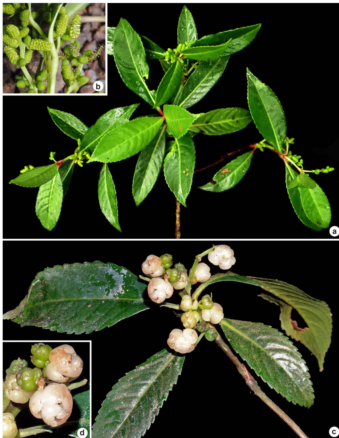
Figure 1 – a-d. Hedyosmum brasiliense – a. branch with staminate flowers; b. detail of staminate inflorescences; c. branch with pistillate flowers; d. detail of pistillate inflorescences.