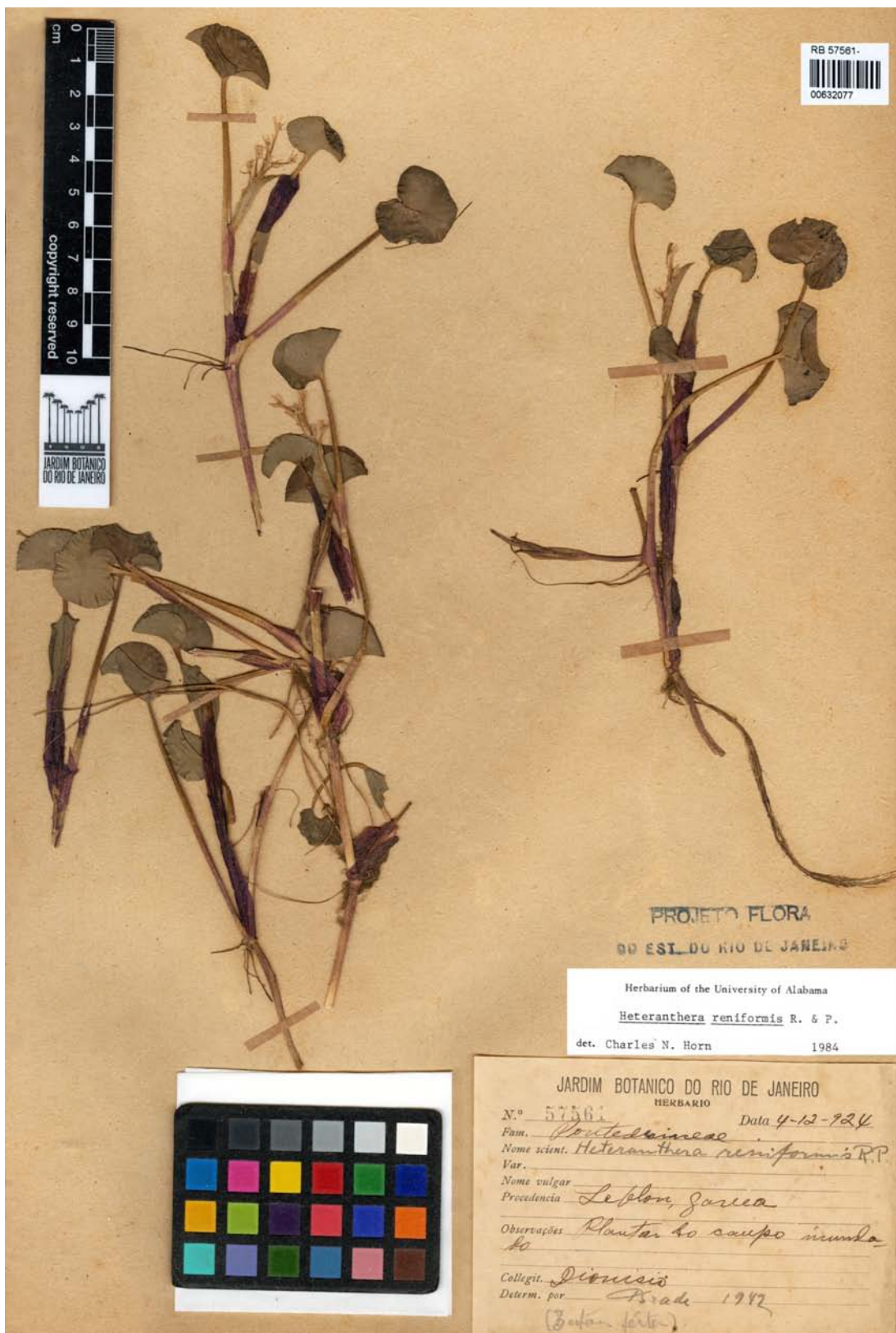
Figure 2— Photo of the epitype of Buchosia aquatica (Dionísio s.n., RB 57561).