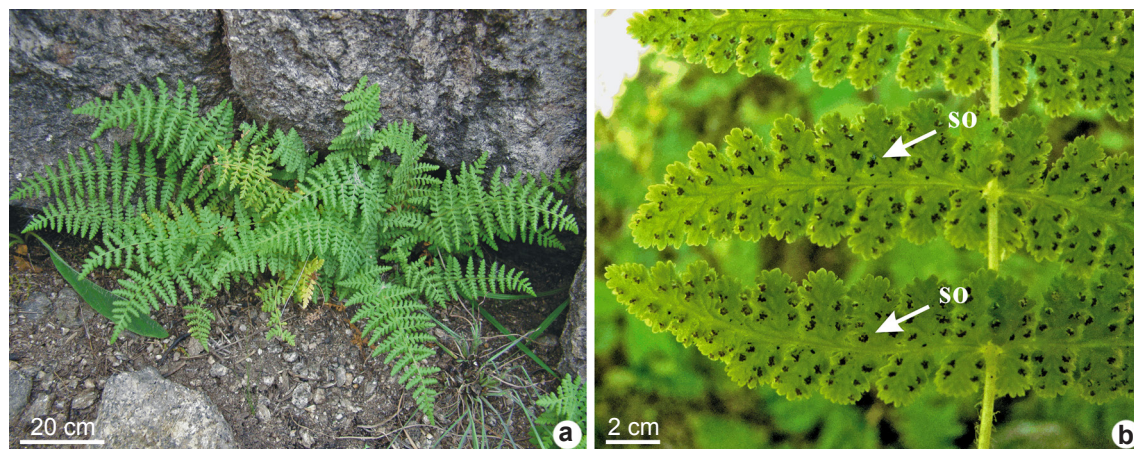
Figure 1 – a-b. Sporophytes of Physematium montevidensis – a. habit; b. detail of a fertile frond. so = sorus.

Materials were placed in paper envelopes and transported to the laboratory where they were maintained at room temperature (20–25°C) until spore release. The remains of sporangia were eliminated by a mesh with pores 88 µm in diameter. The spores were not sterilized before sowing. They were cultured in previously autoclaved (120 °C for 20 minutes) Petri dishes 9 cm in diameter, containing Dyer liquid medium (Dyer 1979). The dishes (10 repetitions) were sealed with Parafilm and placed in a growth chamber with a photoperiod of 12 hours under white fluorescent illumination 28 µmol m -2 s -1 at 20±2 °C. The cultures were