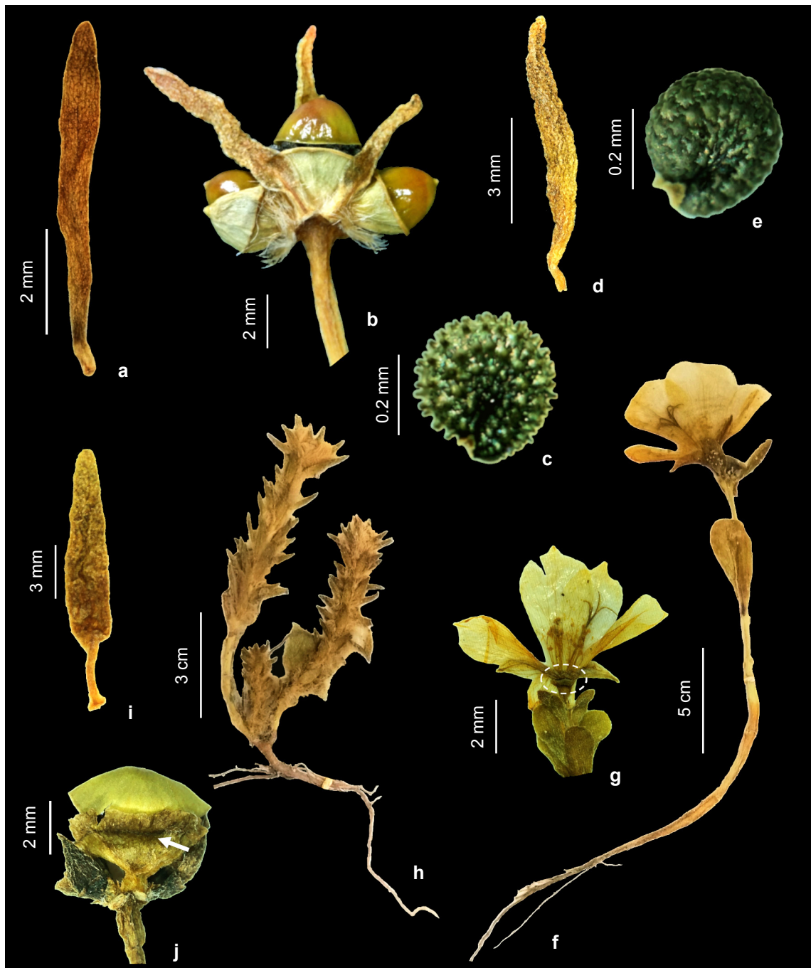
Figure 4 – a-j. Portulacaceae of Ceará – a-c. Portulaca elatior – a. leaf; b. infructescence with three pyxis; c. ornamented seed; d-e. P. halimoides – d. leaf; e. ornamented seed; f-g. P. oleracea – f. habit; g. flower with the detail of one crenate dorsal sepal (dashed white circle); h. P. pilosa – h. habit; i-j. P. umbraticola – i. leaf; j. pyxis with winged expansion (white arrow). [a-c. I.M.B. Sá 18 (EAC); d-e. M.I.B. Loiola et al. 2243 (EAC); f-g. E.B. Souza et al. (EAC 29989); h. L.W. Lima-Verde et al. 596 (EAC); i-j. E.B. Souza et al. 1824].