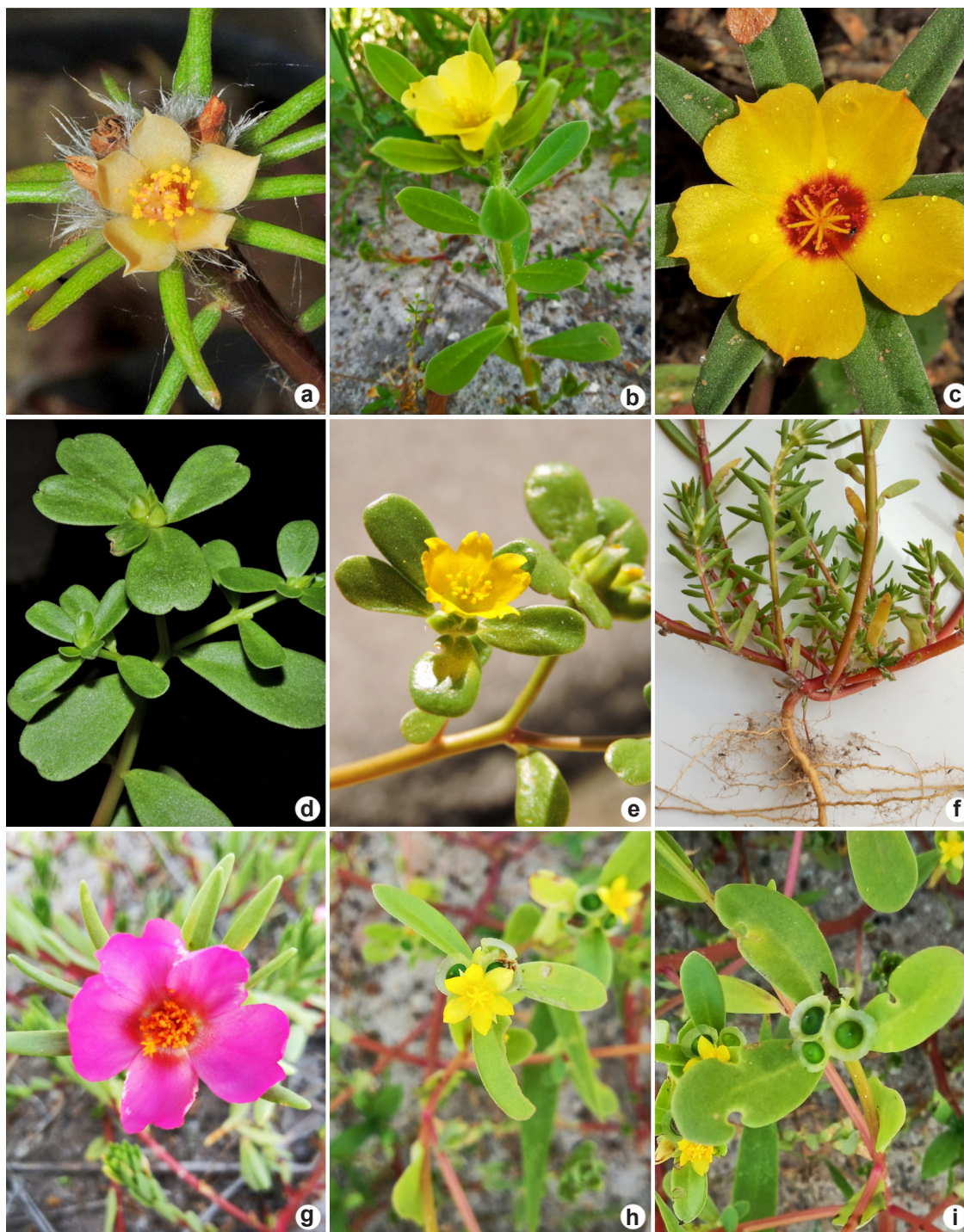
Figure 3 – a-i. Portulacaceae of Ceará – a. Portulaca elatior ; b-c. P. mucronata ; d-e. P. oleracea ; f-g. P. pilosa ; h-i. P. umbraticola.