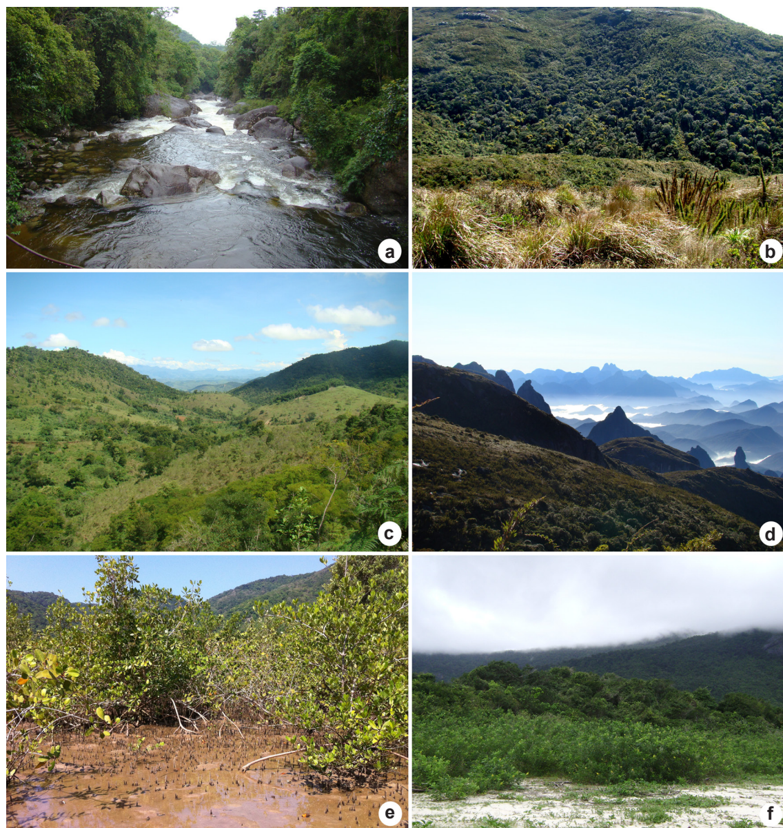
Figure 1 – Vegetation types in the Rio de Janeiro state, examples – a. Dense Montane Ombrophylous Forest, Parque Nacional do Itatiaia; b. Dense Montane High Ombrophylous Forest; c. Montane Semideciduous Seasonal Forest, in the municipality of Cambuci; d. High Altitude Field, Parque Nacional da Serra dos Órgãos, and the Parque Estadual dos Três Picos in the background; e. Mangrove, Rio de Janeiro; f. Restinga, Marambaia Island.

It was this landscape and species richness that, without a doubt, encouraged Frei José Mariano da Conceição Vellozo, in the 18 th century, to undertake the first study that was to focus objectively on taxonomic knowledge of the flora of Rio de Janeiro