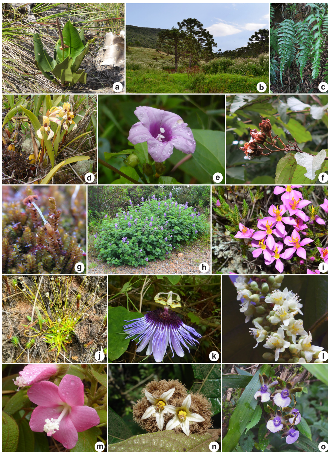
Figure 2 – Plant species in the flora of the Rio de Janeiro state, examples – a. Anthurium minarum ; b. Araucaria angustifolia ; c. Asplenium cariocanum ; d. Brasiliorchis ubatubana ; e. Ipomoea bonariensis ; f. Luehea grandiflora ; g. Jungermannia hyalina ; h. Lupinus gilbertianus ; i. Microlicia isophylla ; j. Paepalanthus ovatus ; k. Passiflora amethystina ; l. Paullinia rubiginosa ; m. Pavonia malacophylla ; n. Solanum cernuum ; o. Zygopetalum mackayi.