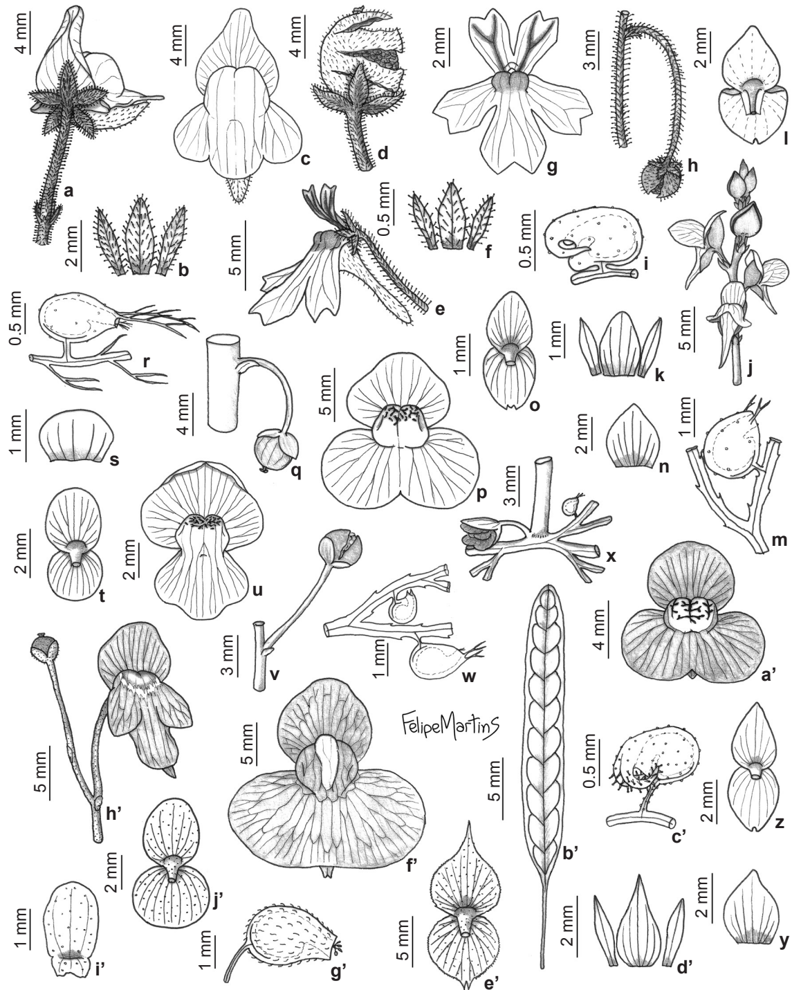
Figure 2 – a-d. Genlisea aurea – a. flower (back view); b. bract and bracteoles; c. corolla (front view); d. capsule. e-h. Genlisea lobata – e. flower (lateral view); f. bract and bracteoles; g. corolla (front view); h. capsule. i-l. Utricularia erectiflora – i. utricle; j. inflorescence; k. bract and bracteoles; l. sepals. m-q. Utricularia foliosa – m. utricle; n. bract; o. sepals; p. corolla (front view); q. capsule. r-v. Utricularia gibba – r. utricle; s. bract; t. sepals; u. corolla (front view); v. capsule. w-a'. Utricularia hydrocarpa – w. utricle; x. lowermost cleistogamous flower; y. bract; z. sepals; a'. corolla (front view). b'-f'. Utricularia longifolia – b'. utricle; c'. leaf; d'. bract and bracteoles; e'. sepals; f'. corolla (front view). g'-j'. Utricularia myriocista – g'. utricle; h'. inflorescence; i'. bract; j'. sepals.