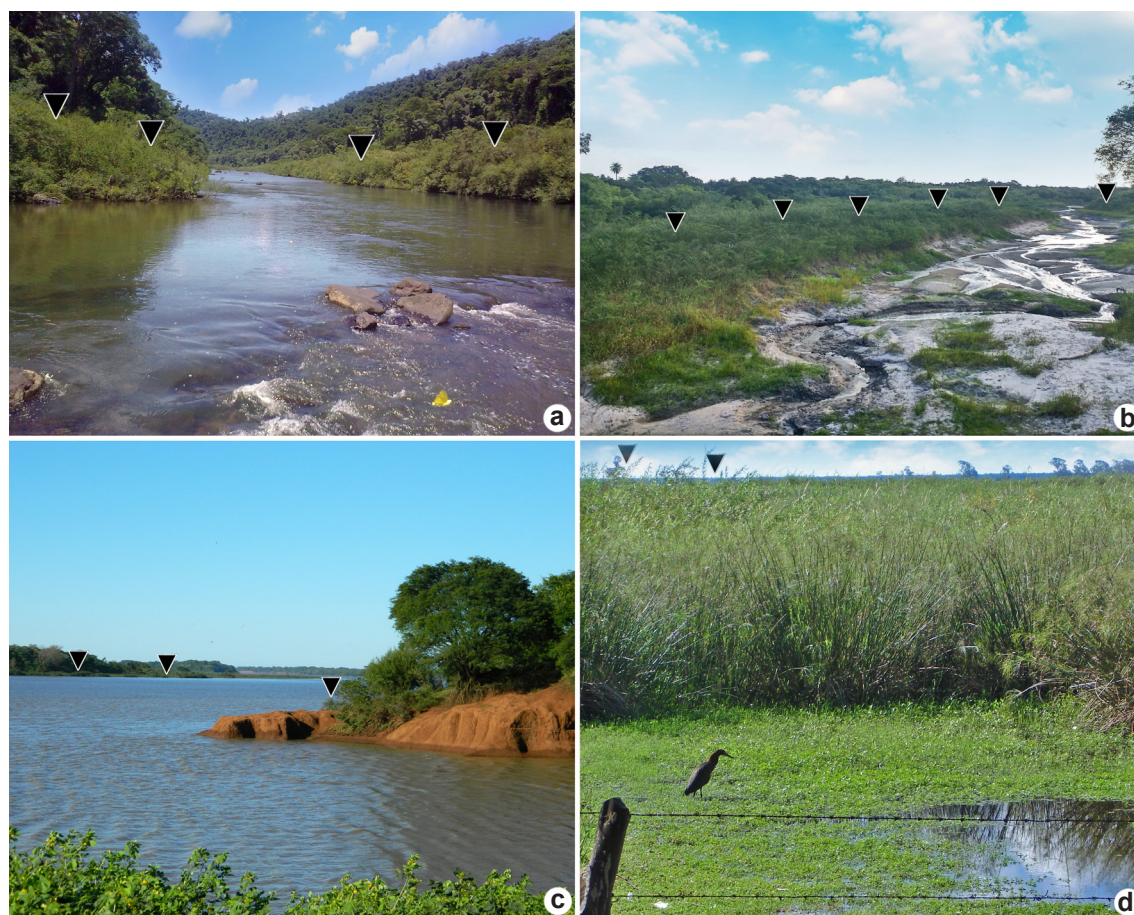
Figure 3 – a-d. Habitats of Cephalanthus glabratus – a. Yabotí river in Misiones, Argentina, the coastal community is composed by Mimosa pellita and some intermingled specimens of C. glabratus (arrows); b. a seasonal affluent of the Riachuelo river (Paraná River basin). There, C. glabratus can be grows on both sides of the stream (arrow); c. view from the Argentinian part of Uruguay River during the rise of river, showing the community in where C. glabratus grows (arrow); d. view of the coastal of a lagoon, inside Iberá system, Concepción, Corrientes, Argentina, showing a dense and impassable community of Schoenoplectus californicus and Cephalanthus glabratus (arrows).

Itá, represa Machadinho, and Salto Grande; and other dams projected in the next years: Garabí and Panambí dams, in Argentinean-Brazilian border), and Rio Negro river, in Uruguay (three dams in operation). In Argentina, provinces of Corrientes and Entre Ríos, the habitat of Cephalanthus glabratus was strongly modified to obtain lowlands to rice culture and pine monoculture, and also to expand the livestock activities, these economic activities are currently in a frank expansion in the region. In Southern Brazil, Rio Grande do Sul and Santa Catarina states, Delprete et al. (2004) mentioned that the species has a discontinuous distribution in the basins where it grows. In the