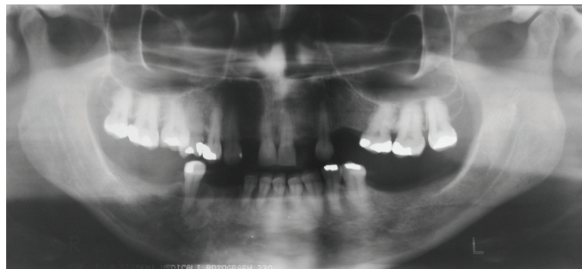
Figure 2. Panoramic radiograph identifying bone rarefaction suggestive of lesion in maxillary right canine region.

The material that was collected and sent for histopathological exam consisted of a fragment of soft tissue measuring 1.7x1.5x0.4 cm.