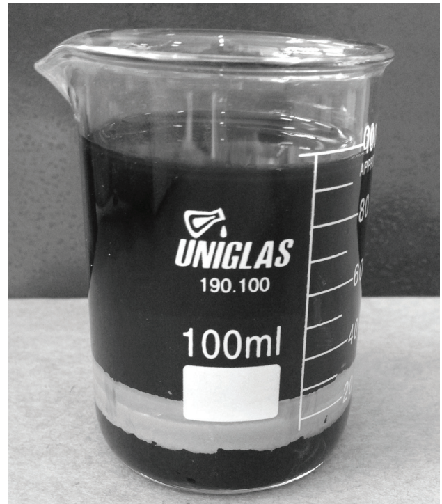
Figure 4. L. ferrea Mouth Wash.

Aseptically, 1 mL of the L. ferrea mouth wash was transferred to 9 mL of phosphate buffer solution pH 7.2 (Synth, Diadema, São Paulo, Brazil), for total microorganism counts. Samples in