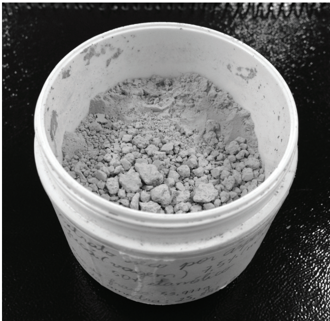
Figure 3. Extract from L. ferrea bean.

Formulation of the mouth wash (Figure 1) was done in accordance with the methodology adapted from Zanin et al. 15 . The components were: sodium benzoate, saccharine, glycerin, L. ferrea extract 7.5% (m/v), 80% Tween, 20% Tween, distilled water, mint essence and 10% sodium hydroxide (Figure 4).