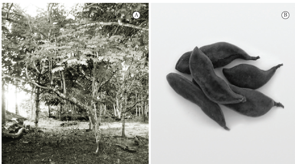
Figure 1. A - L. ferrea tree; B - L. ferrea Fruits (pods).

The extractive solution of L. ferrea was prepared with 7.5 grams of ironwood beans in 500 mL of distilled water and 500 mL of alcohol at 96 °C in decoction for a period of 15 minutes in heat insulation and under reflux. After this period, the material was removed, cooled and filtered, then taken to the Spray Dryer appliance (MSD 1.0, Labmaq, Ribeirão Preto, São Paulo, Brazil) in order to obtain the dry extract by spray drying to the concentration of 7.5% (m/v), with the purpose of obtaining the powder to maintain stability (Figure 3).