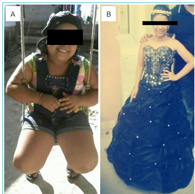
Figure 2 (A) Patient with Cushing's syndrome phenotype; (B) after surgical curing (Case 1).

The authors declare no conflict of interests.