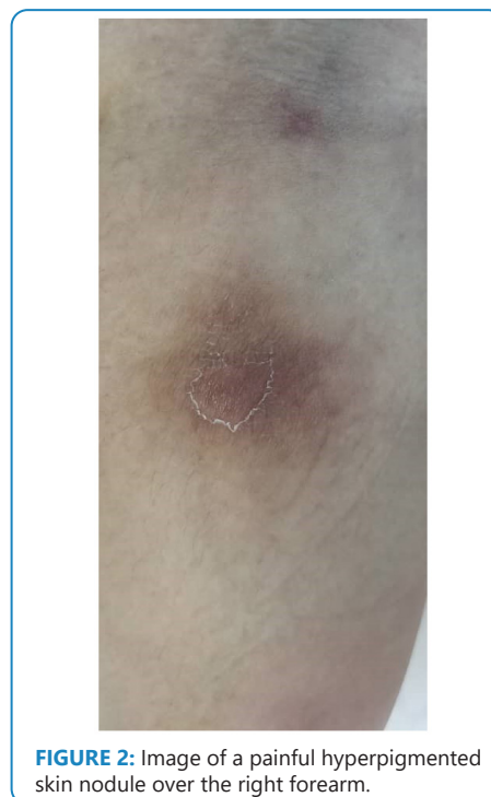
FIGURE 2: Image of a painful hyperpigmented skin nodule over the right forearm.