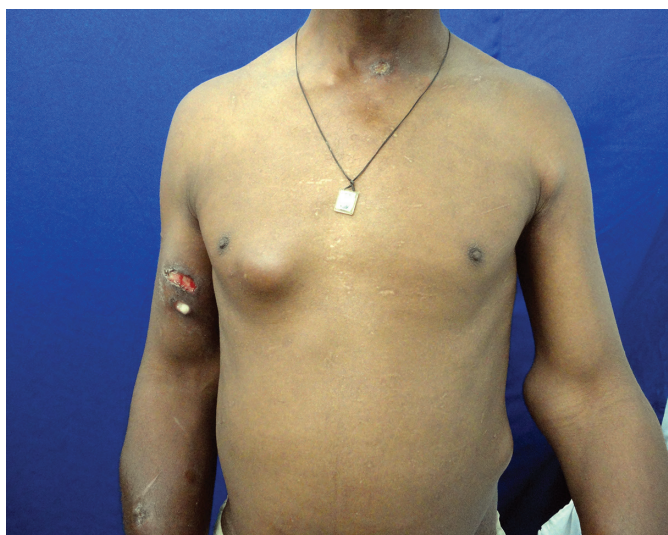
FIGURE 1 - Softened nodules and skin masses in the upper limbs, trunk, abdomen, and cervical region.