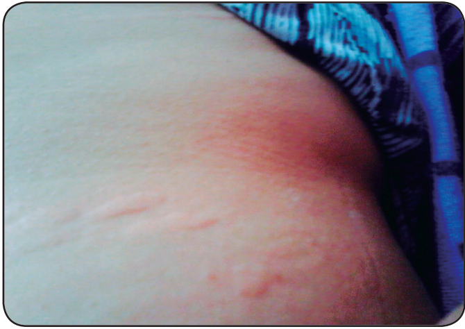
FIGURE 1 - Erythematous lesions in abdomen and indurated plaque in the left axilla and lateral side of the chest. Eight days after the beginning of treatment with benznidazole.

treatment with hydroxyzine (25mg at night-time), an extra dose of cetirizine (10mg after 12 hours if the pruritus was persistent), and prednisolone (30mg for 3 days, followed by a reduction of 10mg every 3 days over 9 days of treatment).