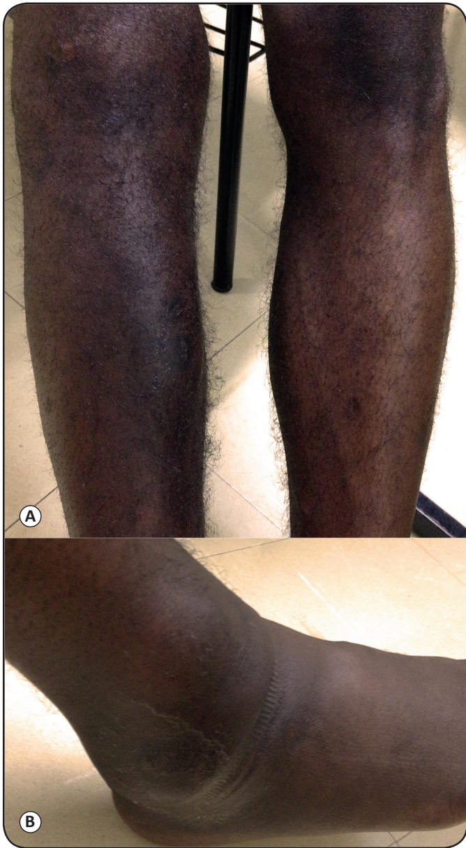
FIGURE 1. Images of the (A) right leg (B) and ankle before treatment. Edema was observed in the dorsum of the right foot, ankle, and pretibial region from where the purulent material was obtained for culture.

Treatment with 400mg once daily itraconazole was initiated in July 2014, and, after 7 months of therapy, the fistulas and edema were totally regressed. However, the bone damage remained (Figure 3A, 3B and 3C), and the patient continued treatment with Itraconazole.