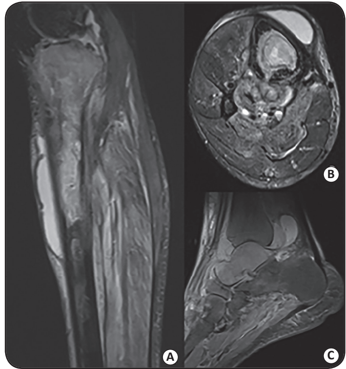
FIGURE 2. Magnetic resonance imaging of the right lower extremity before treatment. (A) Sagittal and (B) Axial short tau inversion recovery images of the tibia showed areas of abnormally high signal intensity in the bone marrow, fistula drainage into the posterior adjacent tissue, and abscess formation in the pretibial space. (C) A sagittal proton density image of the ankle showed the abnormal high signal intensity of the talus bone marrow and fluid with varying signals within the articular space and the adjacent soft tissues, indicating a distinct protein content.

The most frequent presentation of sporotrichosis is either a subacute or a chronic, ulcerated and/or verrucous, erythematous nodule at the site of entry of the fungus into the