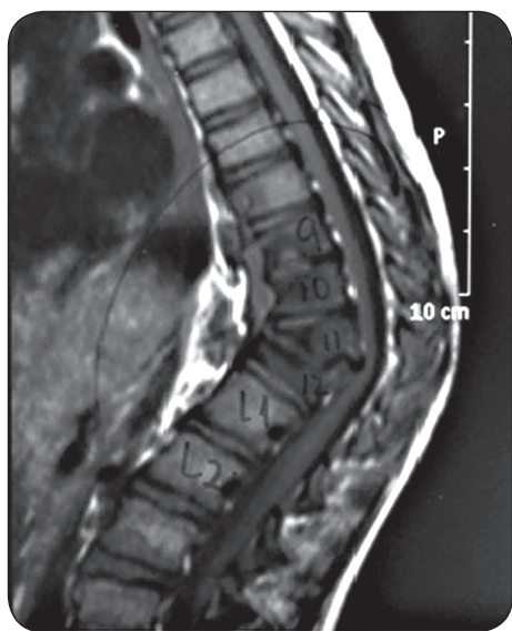
FIGURE 1 - Sagittal magnetic resonance giving evidence of the collapse of the T11-T12 vertebral bodies with their posterior displacement, determining compression on the ventral surface of the medulla and the appearance of kyphosis of the thoracic spine in this region.

The NMR of the thoracic spine showed signal alteration at T9, T10, T11 and T12 vertebral bodies with post-contrast enhancement, a slightly increase of prevertebral soft tissues and collapses of the T11-T12 vertebral bodies with their posterior displacement. Those alterations determining compression on the ventral face of the medulla and the appearance of kyphosis in this region. Despite the compressive effect exerted by the posterior displacement of the T-11 and T-12 vertebral bodies, the spinal cord maintained a normal signal intensity ( Figures 1 and 2 ).