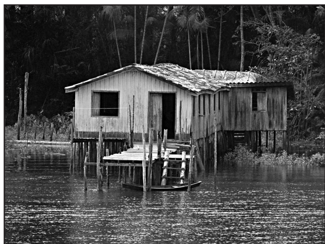
FIGURE 2 - Riparian's community house on Pacuí island, Cametá, Belém, State of Pará, Brazil.