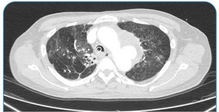
FIGURE 3: Computed tomography angiogram showing a ruptured aortic arch saccular aneurysm (arrow).

Mycotic pseudoaneurysms and massive pericardial effusion due to Salmonella infection rarely occur 1 . However, complications are often fatal. Hence, early diagnosis and intervention are crucial to reduce mortality 1 .