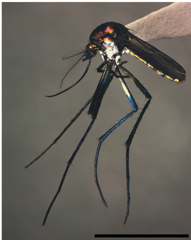
FIGURE 2: Photo of female Haemagogus spegazzinii . Scale bar: 10 mm.