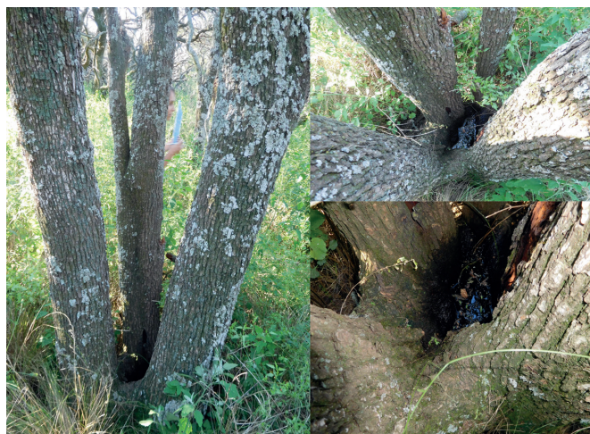
FIGURE 1: Breeding site of Haemagogus spegazzinii in Prosopis caldenia .