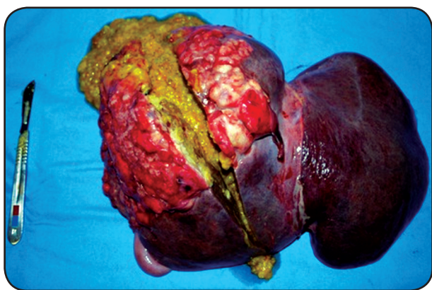
FIGURE 3 - Macroscopic appearance of explanted liver, showing multiple cysts with cavities filled with amorphous necrotic material.