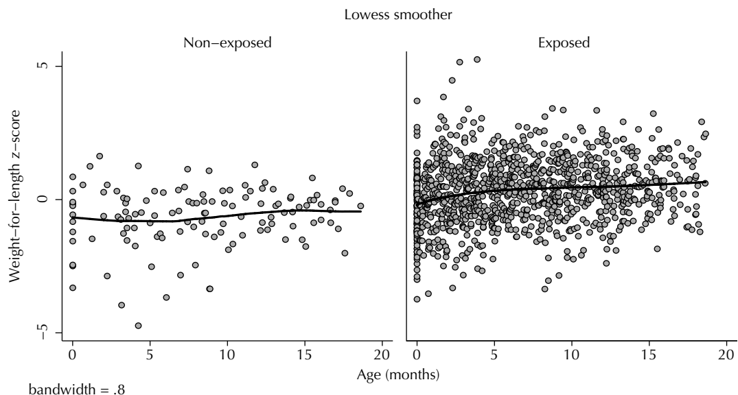
Figure 3. Observed weight-for-length z-scores by exposure to prophylactic treatment to prevent the vertical transmission of HIV. Belo Horizonte, Southeastern Brazil, 1995-2003.

The variables clinical group ( p < 0.0005 ), age ( p < 0.0005 ) and exposure to antiretroviral therapy for PMTCT ( p = 0.003 ) were significantly associated with the weight-for-age z-score in the univariate mixed-effects linear regression analysis. The final model (Table) shows a decrease in the weight-for-age z-score among the infected infants over time. The non-infected infants presented monthly average increases of 0.08 SD in their weight-for-age z-score. At six months, the