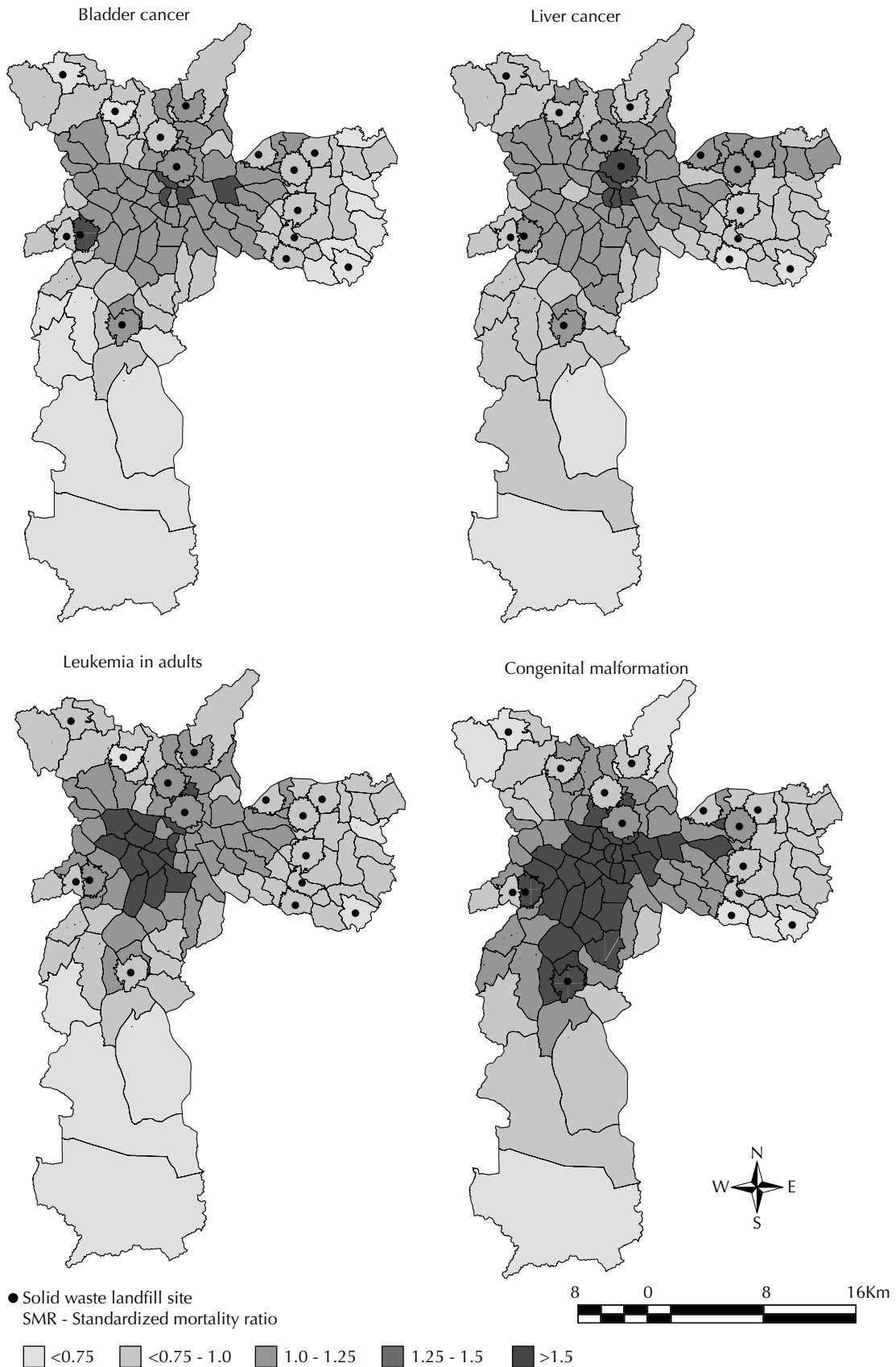
Figure 2. Standardized mortality ratios for the areas of radius 2 km around the solid waste landfill sites and other districts. City of São Paulo, Southeastern Brazil, 1998-2002.