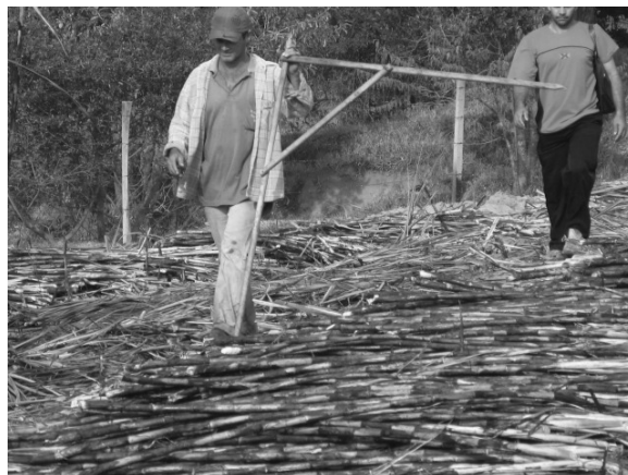
Figure 7 - Team manager with the "2 meter" compass

financed by the plants themselves, with no public control over the process, although in 2013, after a legal decision, a sentence declared the termination of the application for revocation of the seal of social responsibility of a plant in the interior of São Paulo that did not meet workers' rights by not granting the seal without prior inspection of the Ministry of Labor (Legal Decision, 2013).