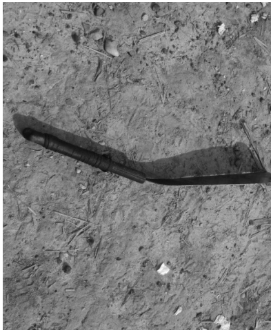
Figure 3 - Machete adapted to facilitate cutting and an un-adapted machete

As for the use of the protective equipment (protective sleeves, headgear, shin guards, goggles and gloves), obligatory according to the law, it was observed that they were worn and old and that there was no new equipment available to substitute them, as shown in Figure 4.