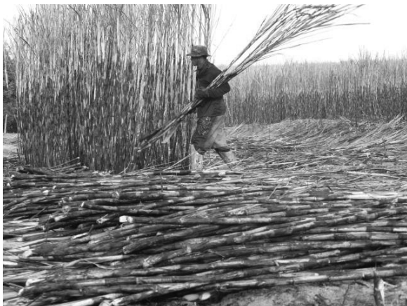
Figure 5 - Standing cane, compared to “rolled” cane