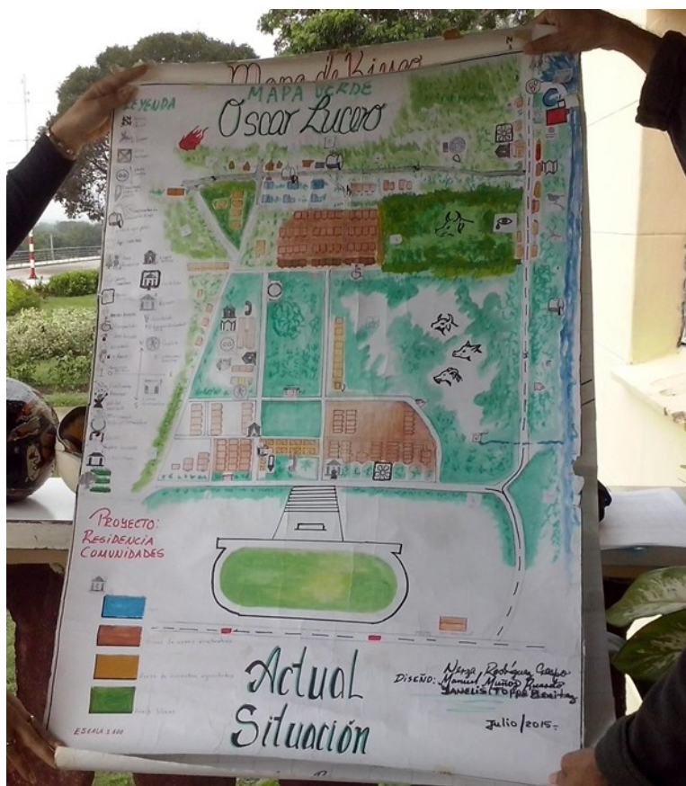
Figure 1- Map of risks designed by the inhabitants at Oscar Lucero Moya community.