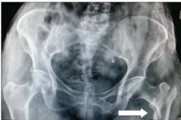
Figure 1. Preoperative radiograph showing Evan's type 4 left intertrochanteric hip fracture (white arrow).

During the surgery, the patient underwent routine uneventful combined spinal and epidural anesthesia. She was positioned supinely on a standard orthopedic fracture table. Closed reduction of the left intertrochanteric hip fracture was performed under image guidance. The surgeon performed a standard skin incision at 5 cm proximally to the tip of the greater trochanter, in line with the long axis of the femur. The entry point was into the lateral aspect of the greater trochanter, as per our usual practice. After reaming, a short proximal femoral nail was inserted easily. Two guidewires were then placed with the aid of the insertion device, to guide the insertion of the recon screws. A distal hip screw was subsequently placed successfully.